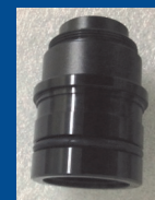
DP200-A Eyepiece Adapter