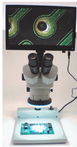
DP200 + DSZV-44CPG microscope